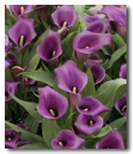
"Words mean more than what is set down on paper. It takes the human voice to infuse them with shades of deeper meaning."

Questions:slange2 || disabilities: pwice || expires: 12/