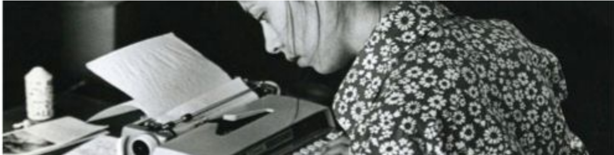
A student writes on a typewriter in Clapp Library.