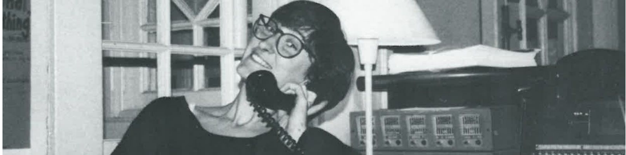
A student chats on the phone while working at the Bell Desk. Photo from the 1990 Legenda .