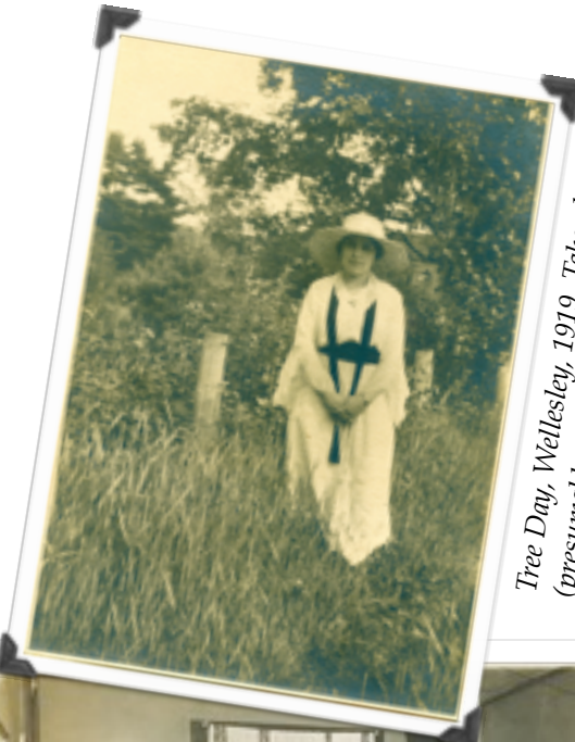
Tree Day, Wellesley, 1919.

Among the treasures are her class ring and photographs from her time at Wellesley. The photos show her room in Wilder Hall, which was demolished in 1930 to make room for Green Hall. She lived in Wilder every year except her first, when she roomed at 11