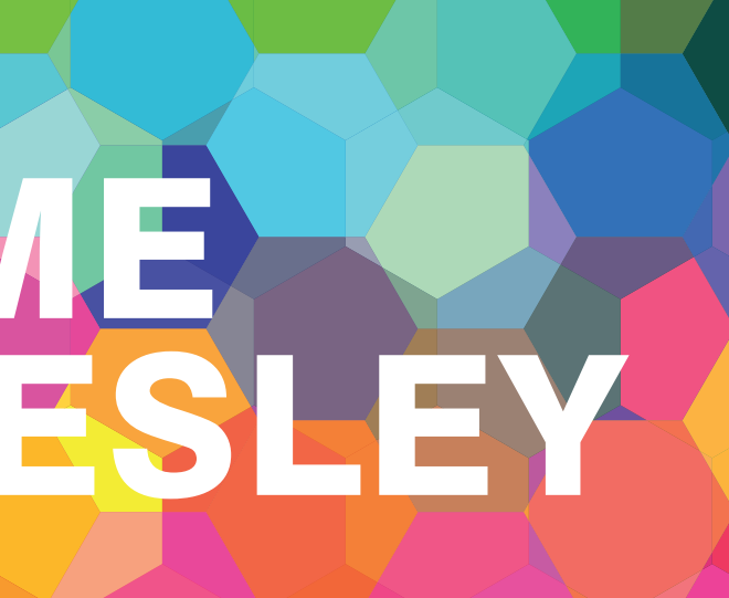
SHANTÉ BROWN Dean of First-Year Students