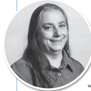
PHOTO CREDITS: Back cover photos, Catherine Kefalas ’89; Front cover and alumnae photos from reunion, Lisa Abitbol; page 1 photo, Natasha Moustache. NOTE: Although WSAS support reaches two-thirds of all Wellesley students, those pictured in this bulletin are not necessarily recipients of WSAS aid.